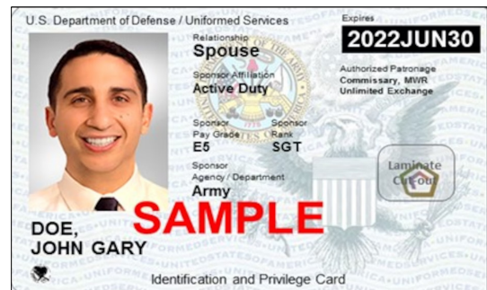
Active Duty Military Spouse ID

1034A Kilani Ave. # 102 Wahiawa, HI 96786 - Office: (808) 621-0899 – Fax: (808) 622-4448